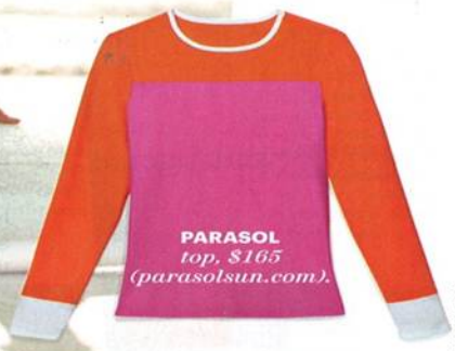
PARASOL top, $165 (parasolsun.com).